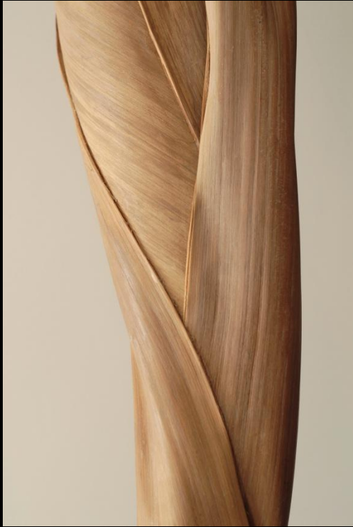
Details of texture