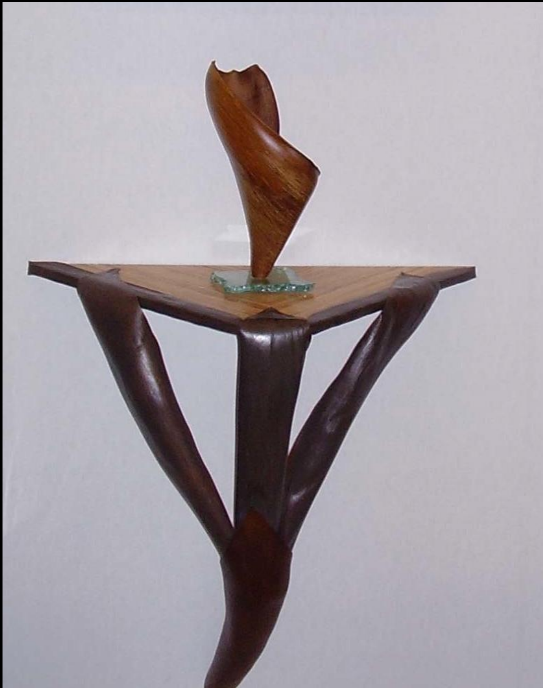
Small console feet in Pambil leaves