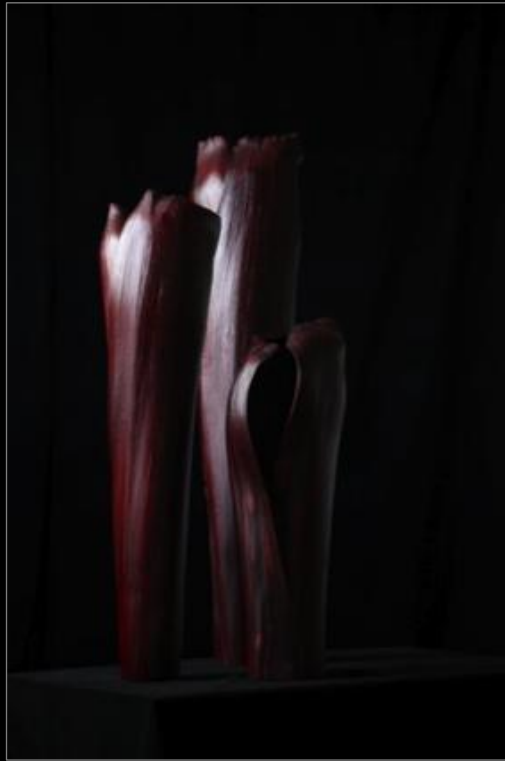
Vase in Pambil leaf