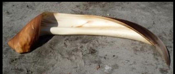
Leaf in final drying