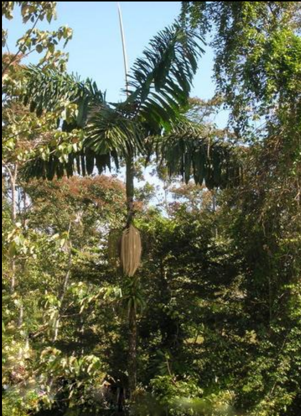
PAMBIL palm tree ( Iriartea Deltoidea )

Rare palm tree of the Ecuadorian primary forest